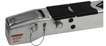
DX16.5 (A160) SHOWN ALSO FOR DX8.5L (A84)

NOTE: REPLACE ANY WARN OUT LABELS WITH ENCLOSED NEW LABELS, AS A SAFETY REMINDER WHEN TOWING.